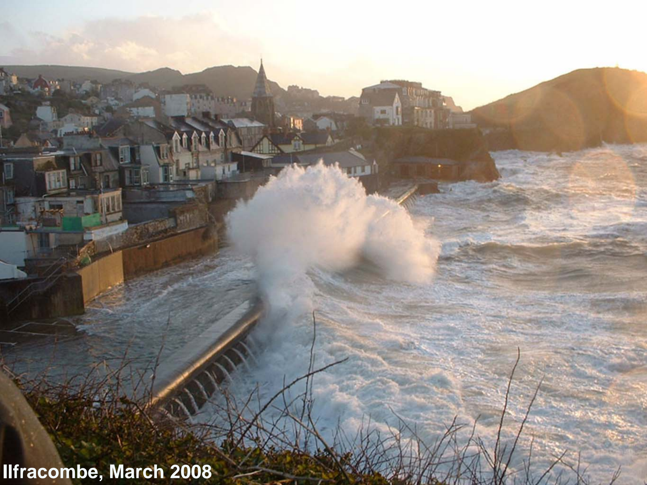
Ilfracombe, March 2008